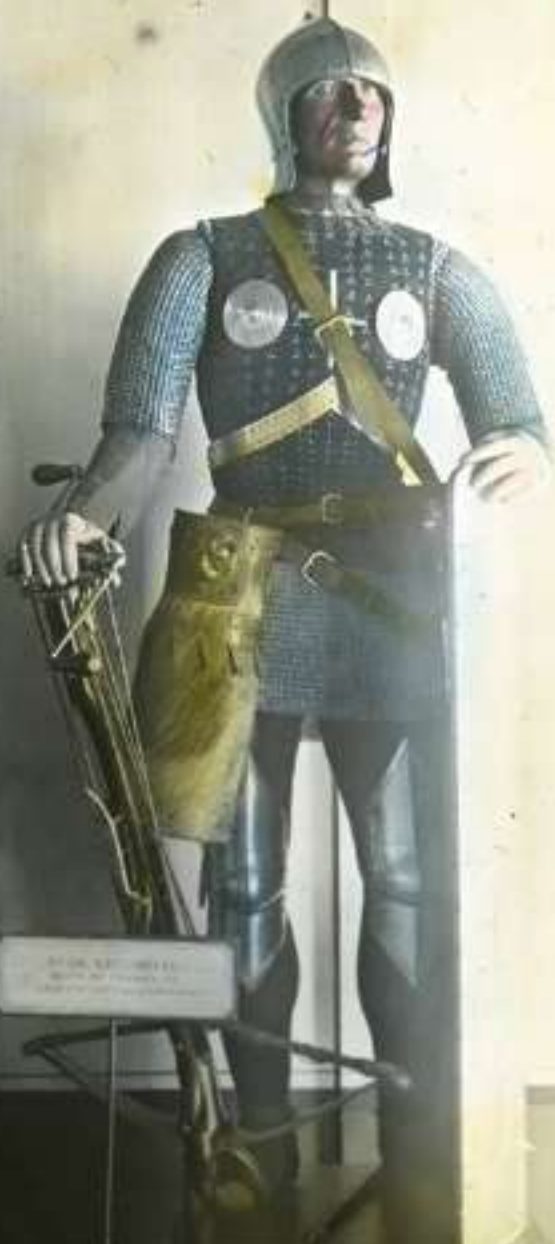
14th Century Plate and Chainmail 15th Century Plate and Chainmail