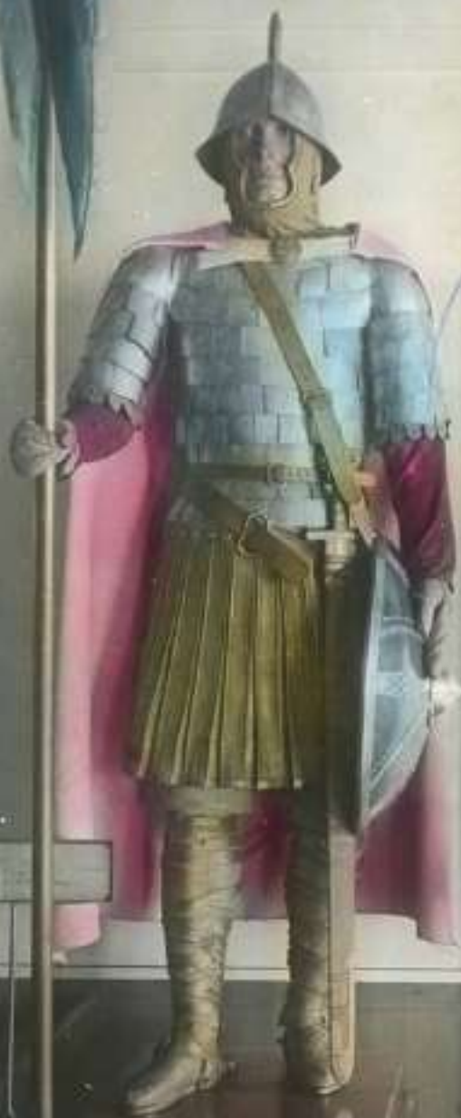
ARMOR OF A KNIGHT