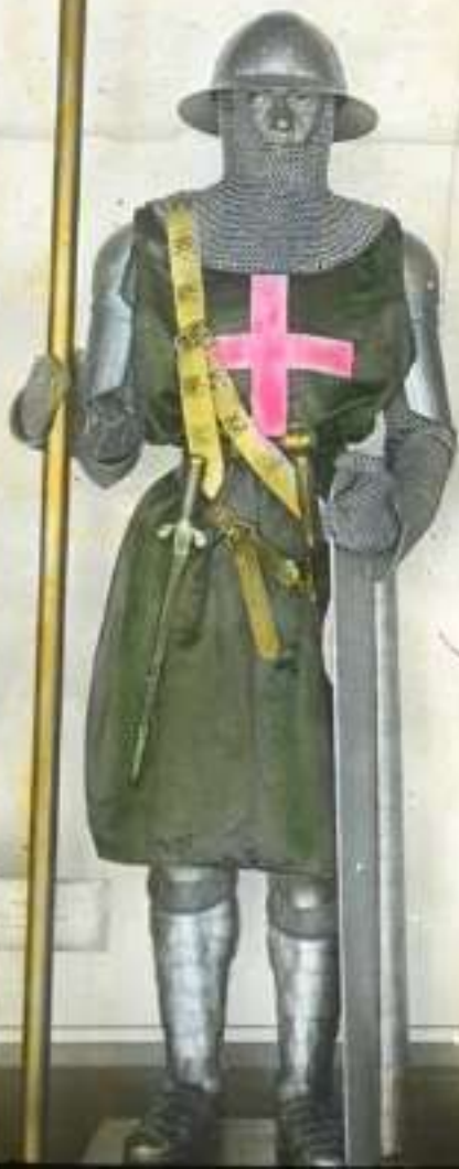
15th Century Plate Armor