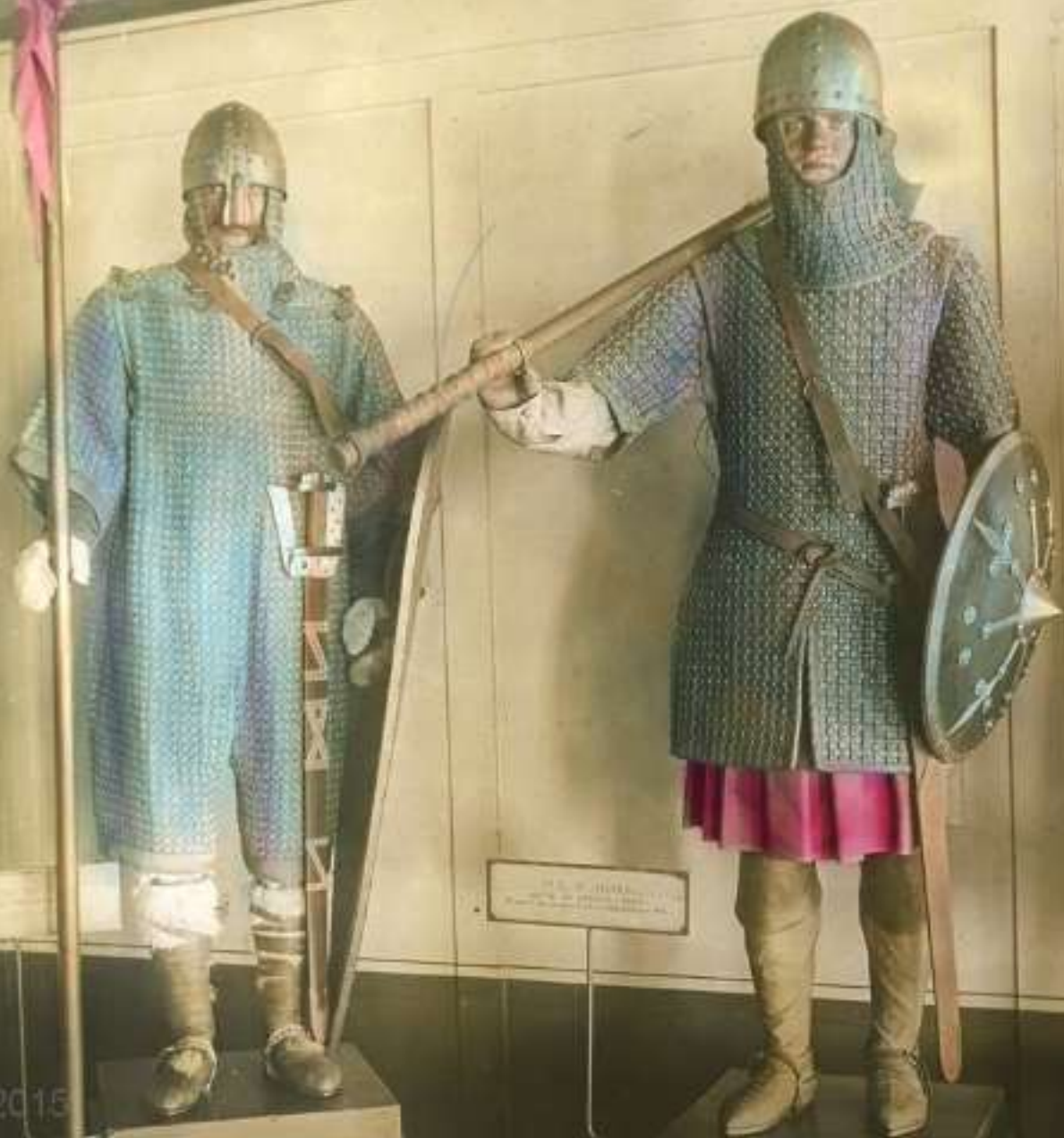
14th C. FULL MAIL ARMOR OF A KNIGHT FROM THE MUSEUM OF HISTORY