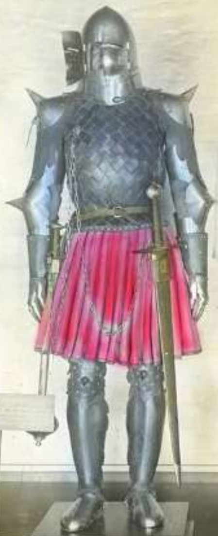
15th Century Plate Armor