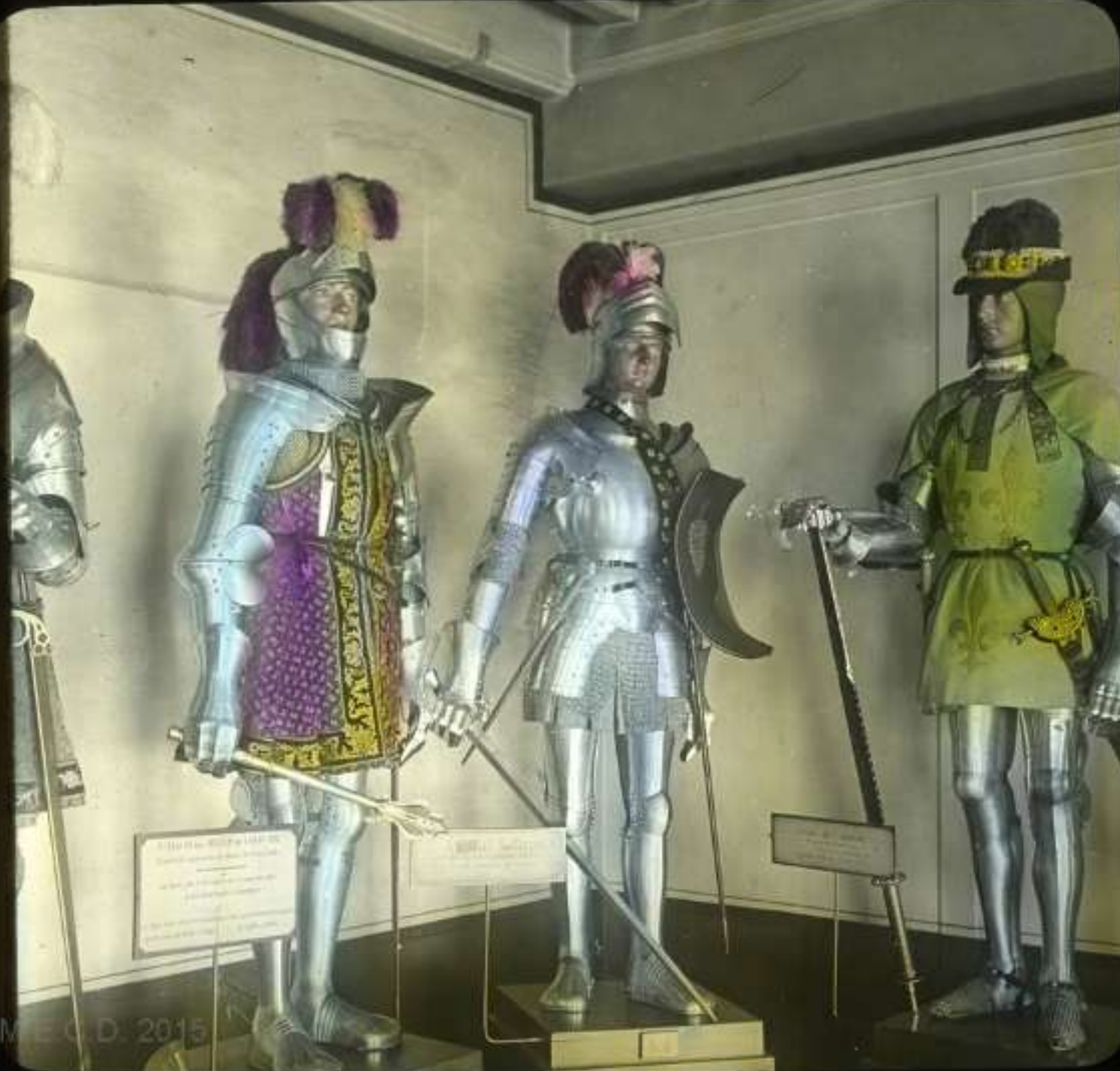
ARMOR OF RICHARD III 1485-1489 The armor of Richard III, King of England, is the most complete set of armor from the late 15th century. It is made of steel and is decorated with gold and purple. The armor is displayed in the museum.