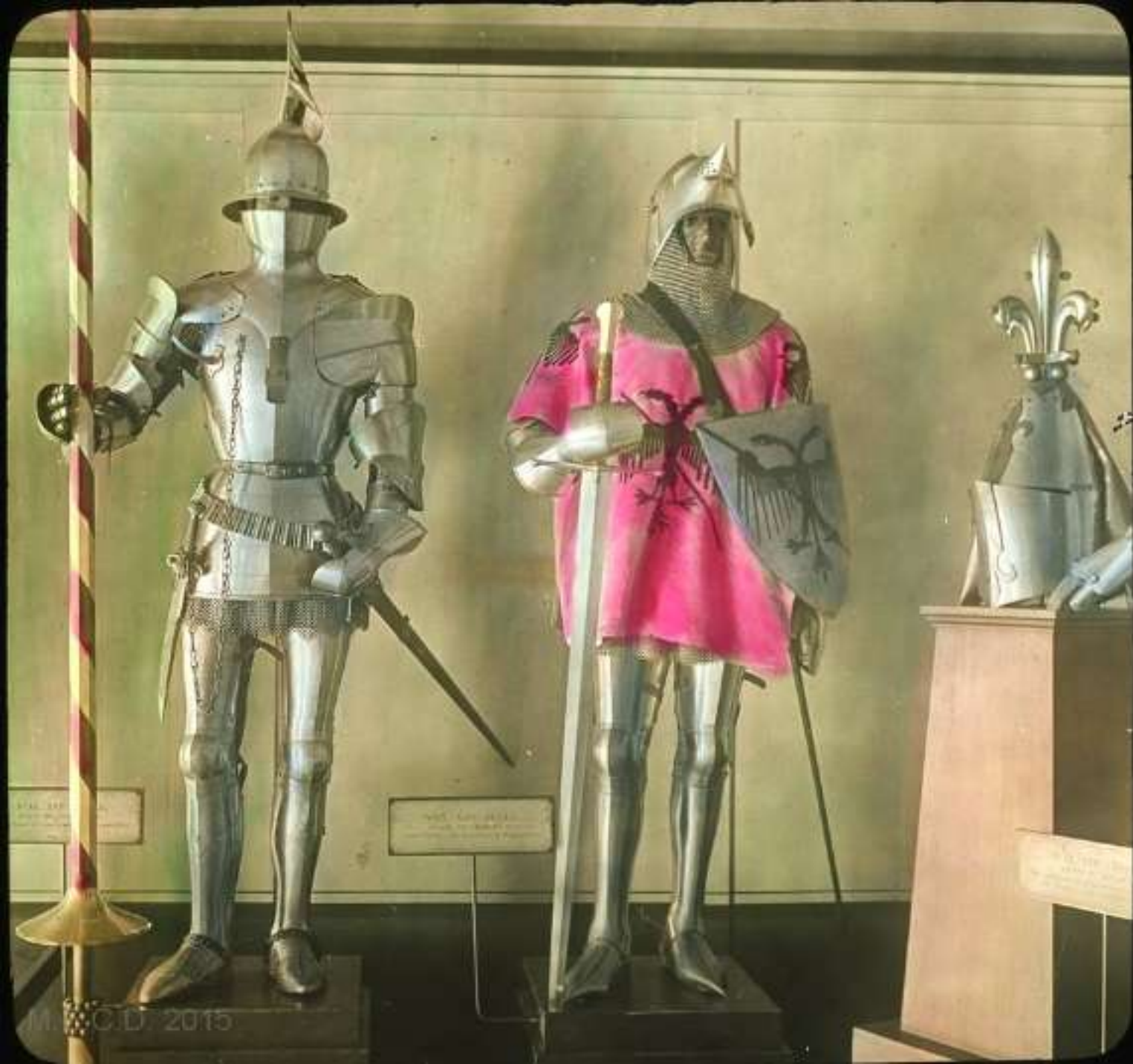
15th Century Plate Armor