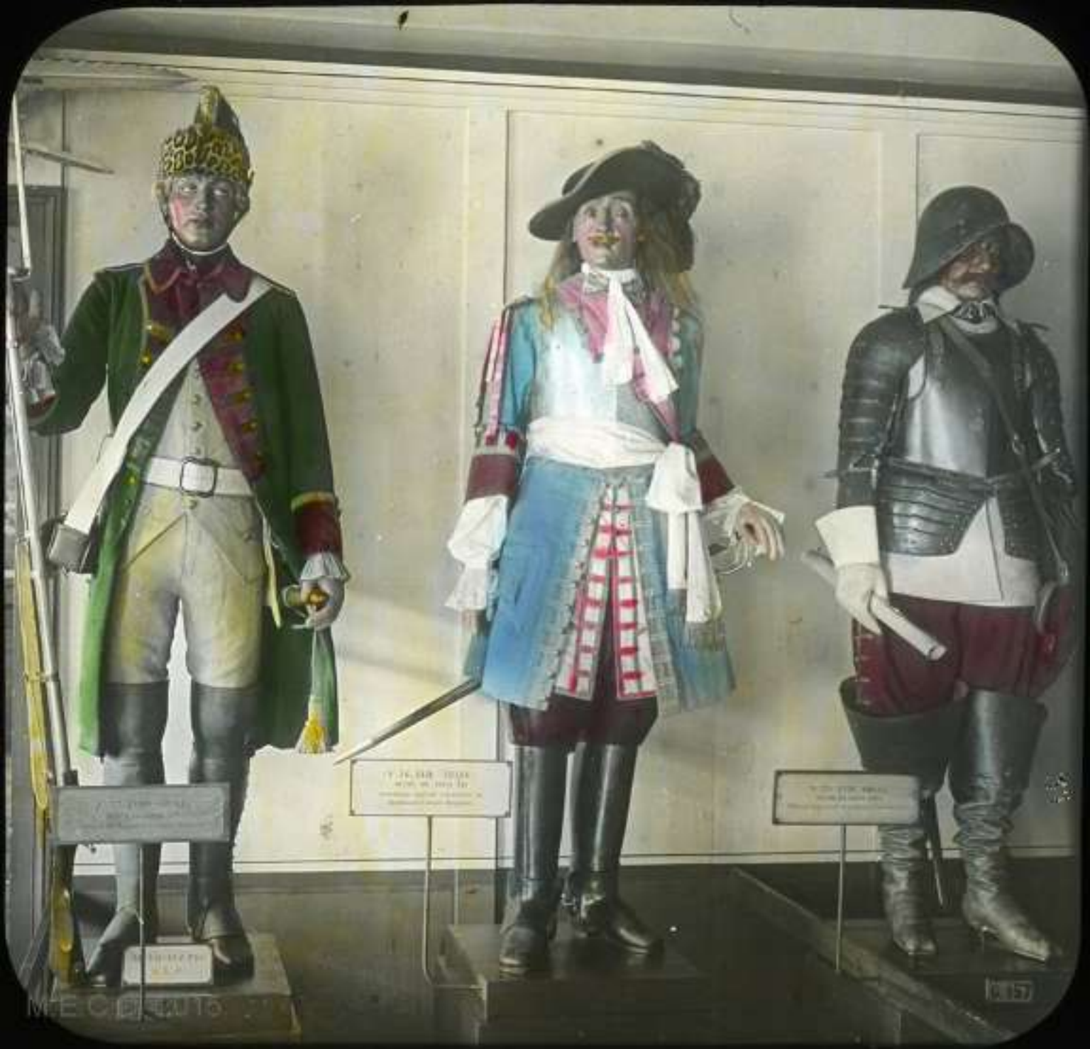
1750-1800 Museum of the City of New York