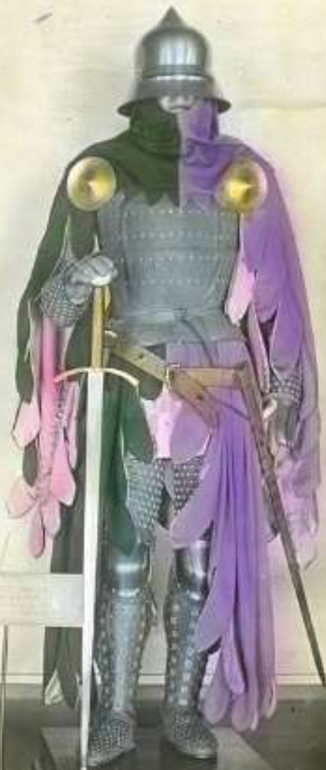
16th Century Plate Armor with Cloak