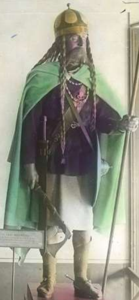
ARMOR OF A KING