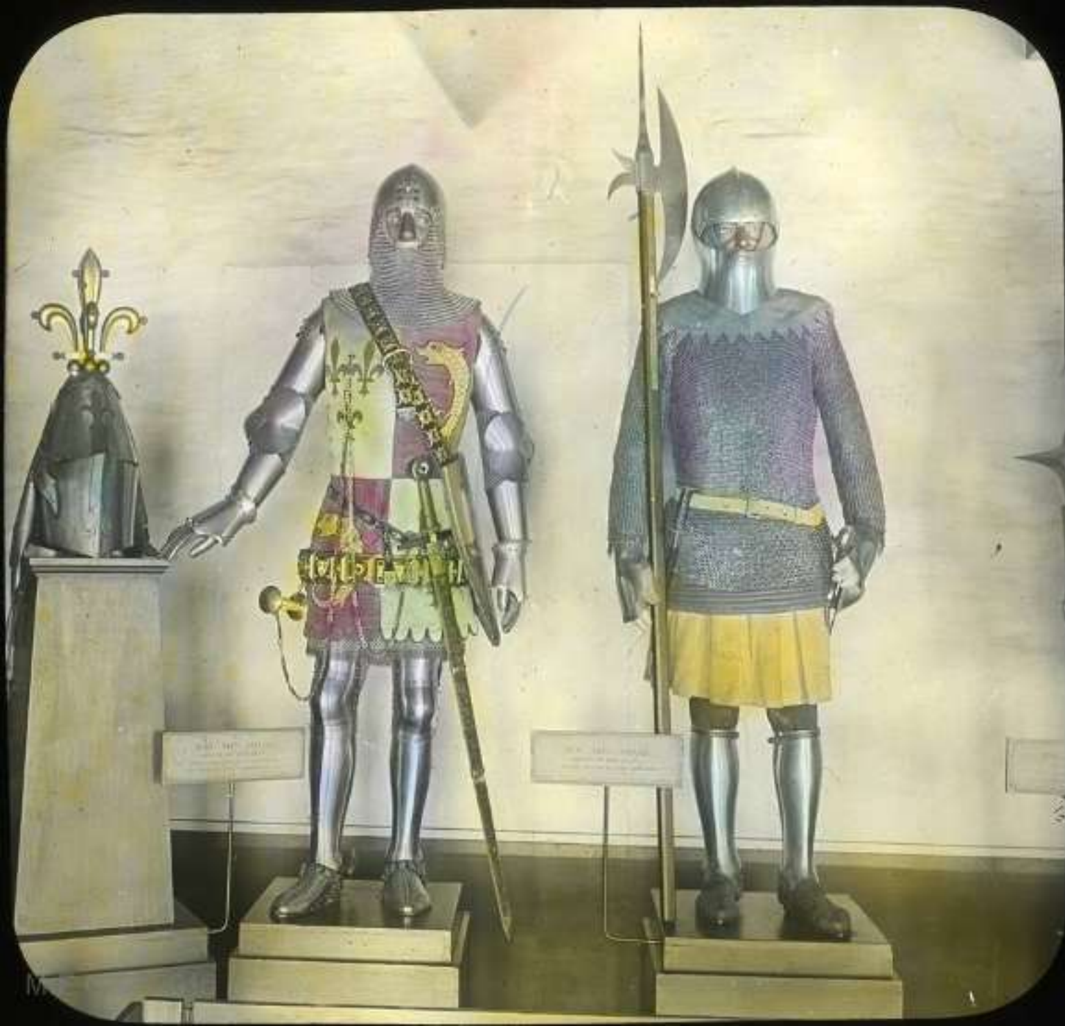
ARMOR OF THE 15TH CENTURY