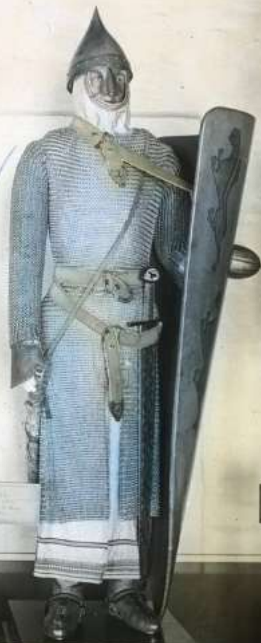
15th Century Chainmail and Shield