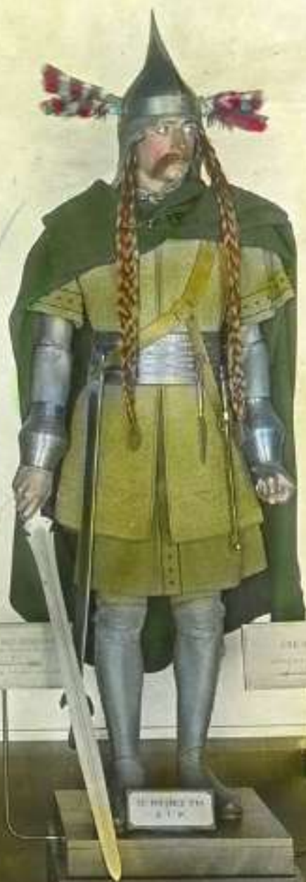
ARMED KNIGHT 15th CENTURY MUSEUM OF THE CITY OF BOSTON