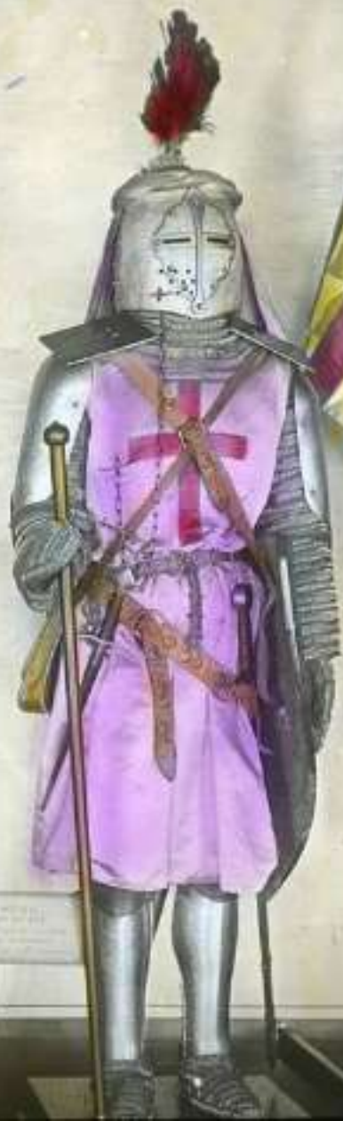
15th Century Plate Armor