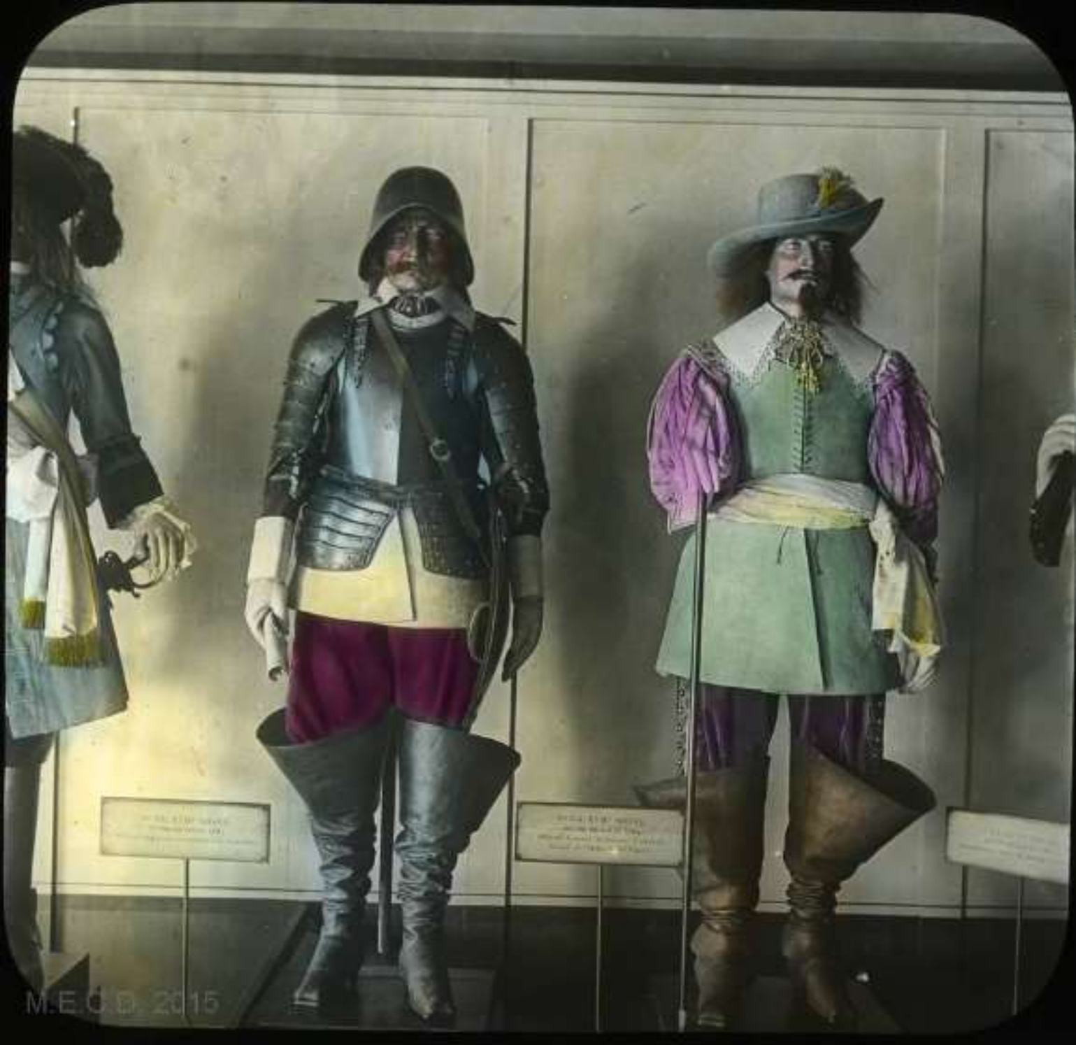
1600-1650 English Cavalier 1650-1660 English Cavalier