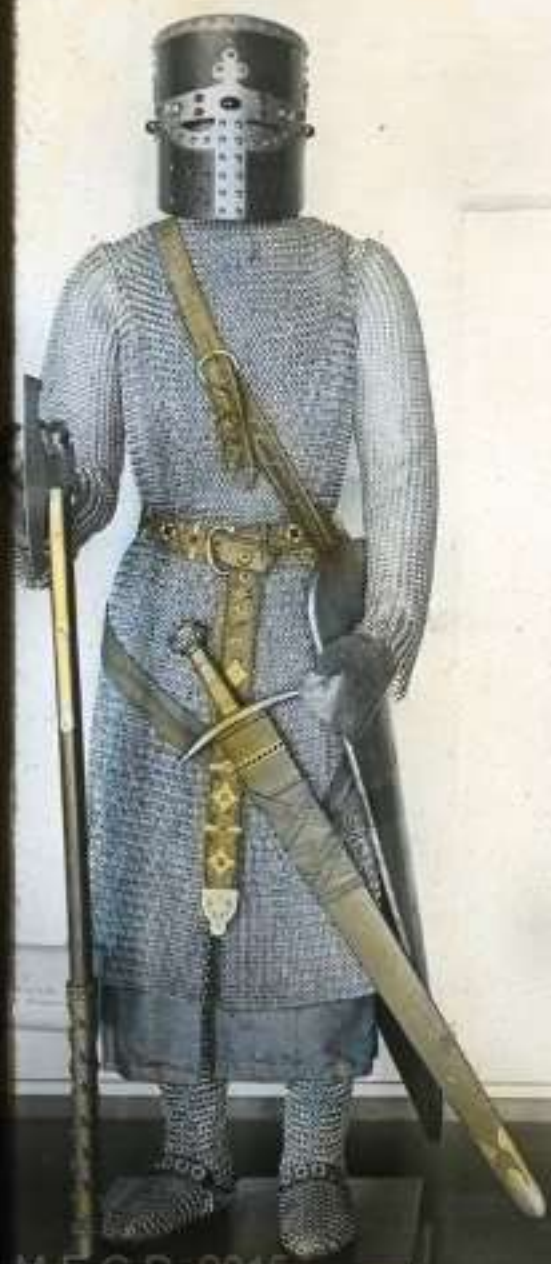
15th Century Plate and Chainmail