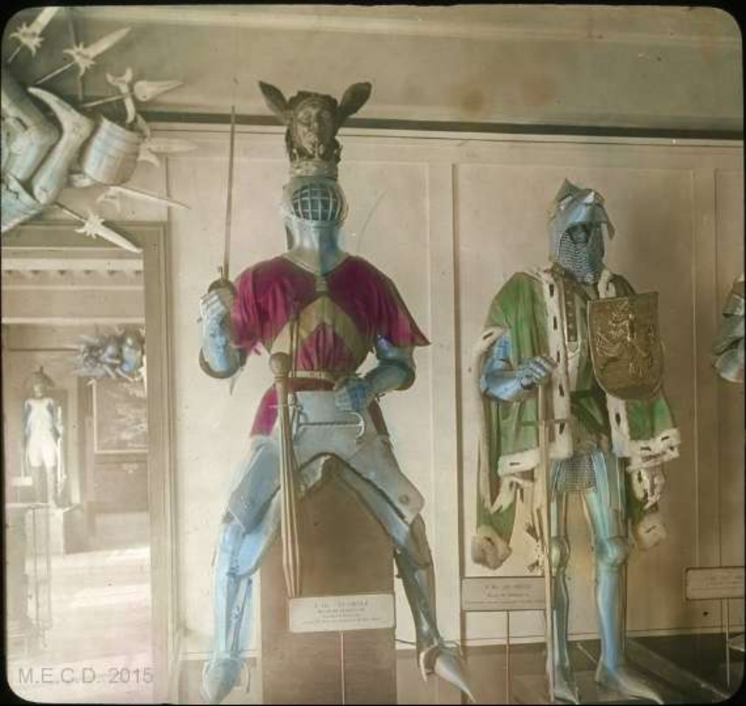
1. The armor of a knight of the 15th century, made of steel plate and chainmail, with a surcoat of red and gold.