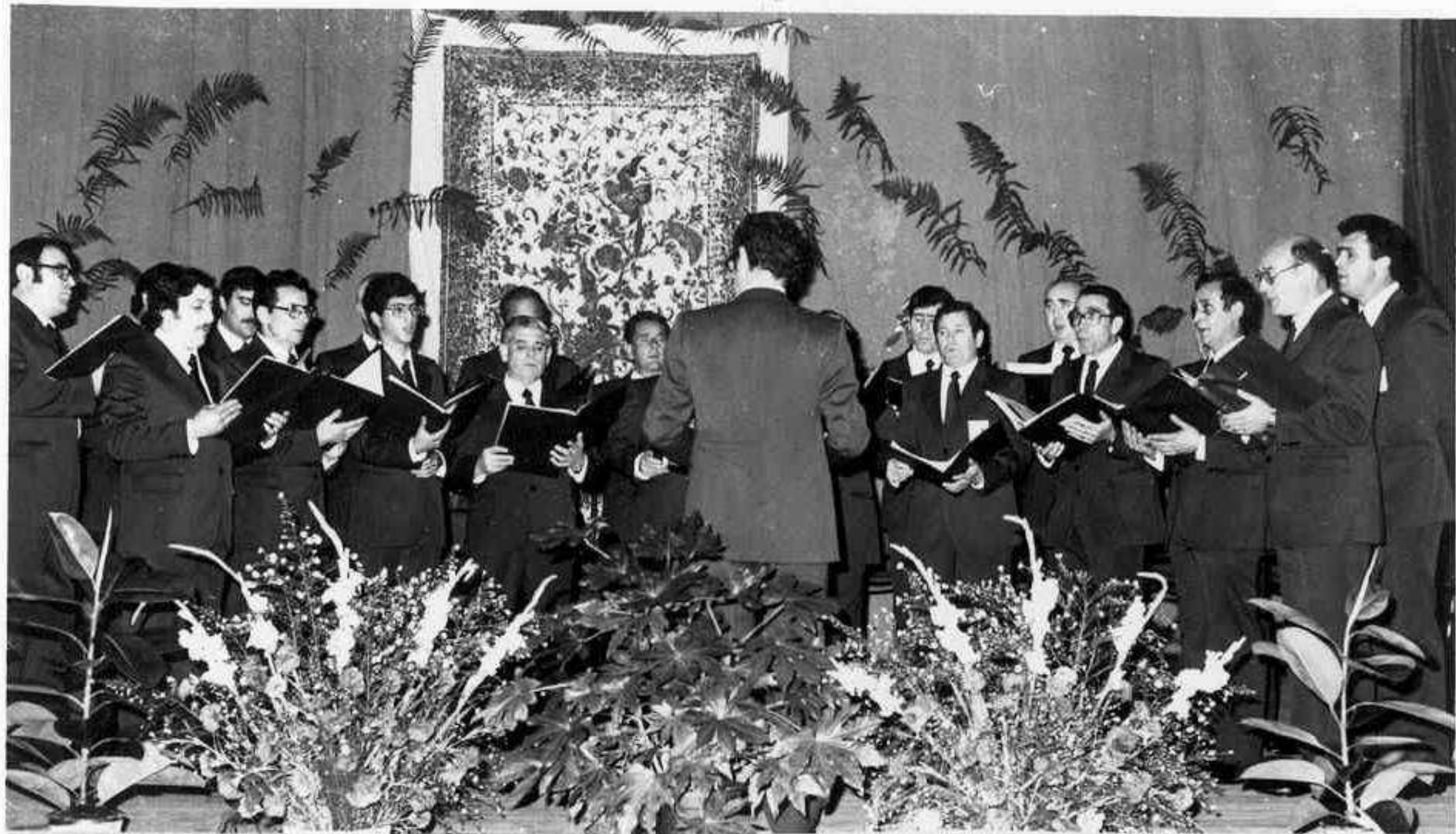
M. E. C. D. 2015