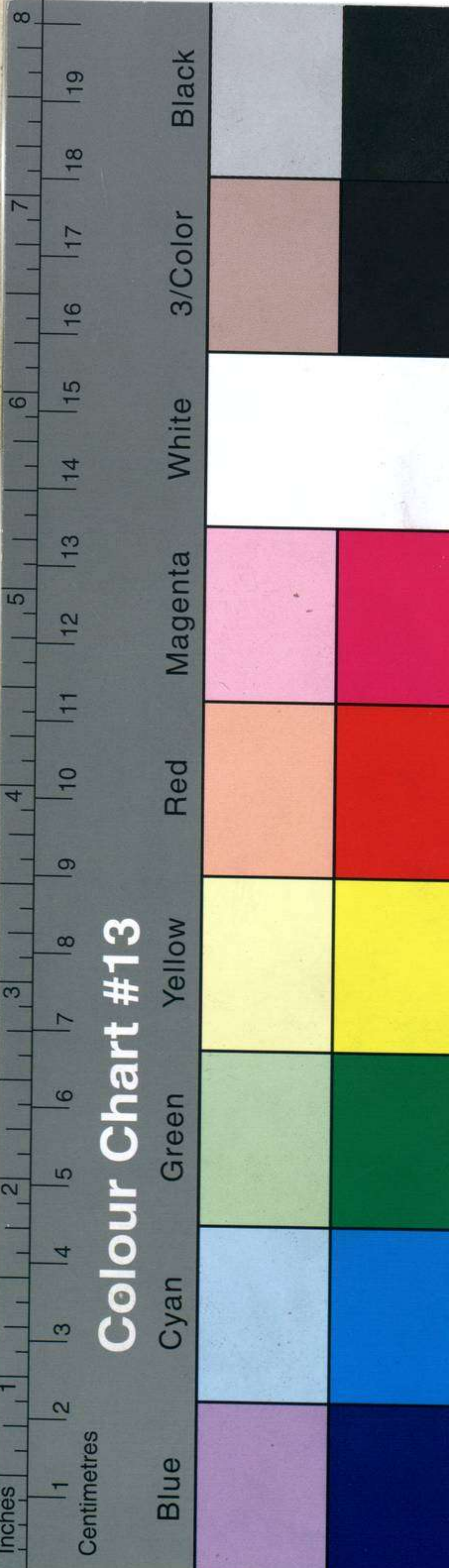
Colour Chart #13