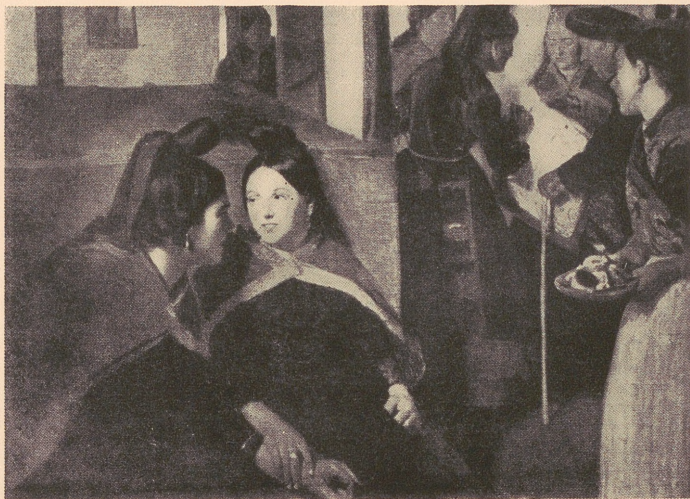
From Palencia, Isabel de. The regional costumes of Spain. Madrid [c1926]. Plate 86.

WOMEN OF THE VILLAGE OF CANDELARIO BY MANUEL BENEDITO VIVES