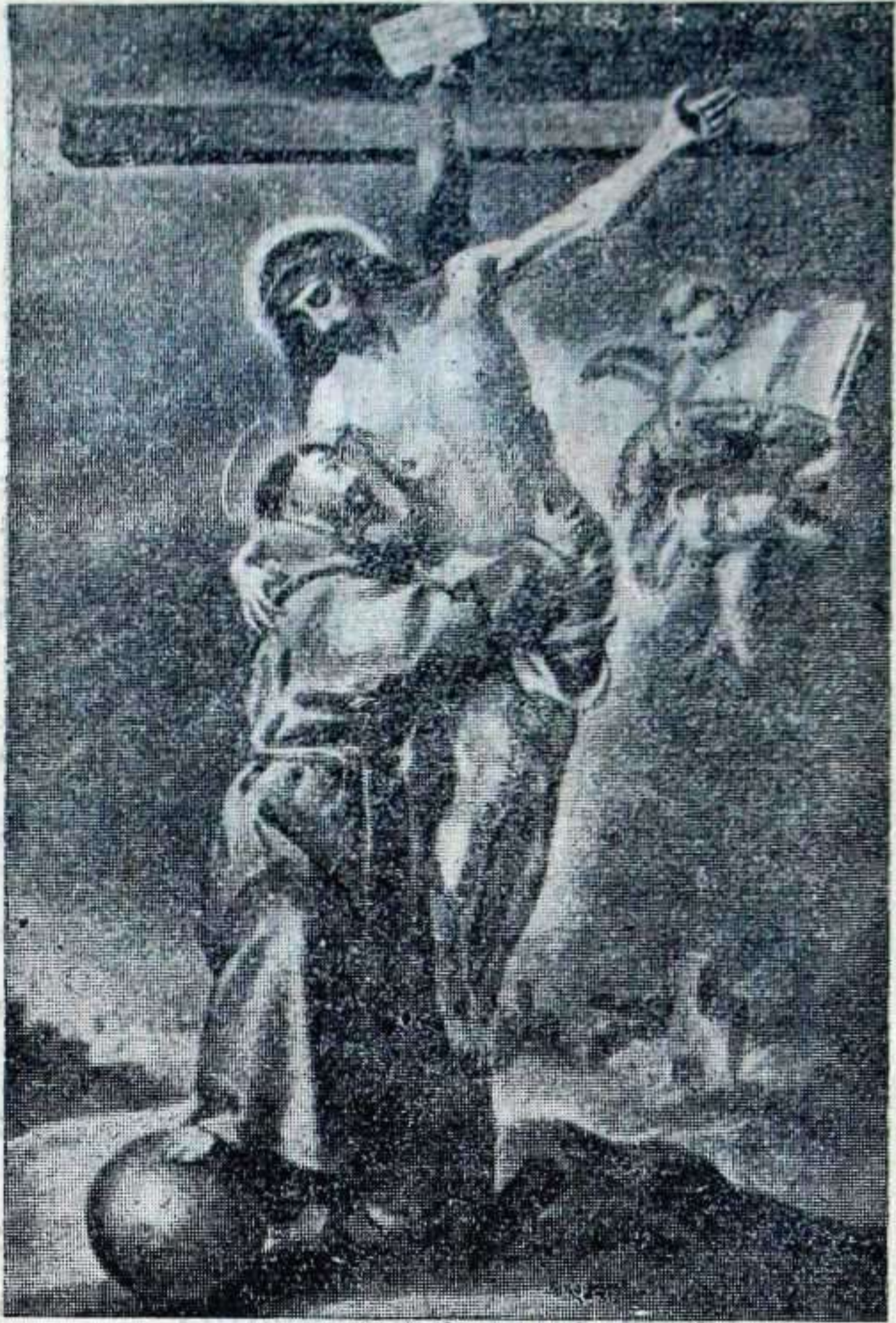
Jesukristo ta Prantzisko Donea